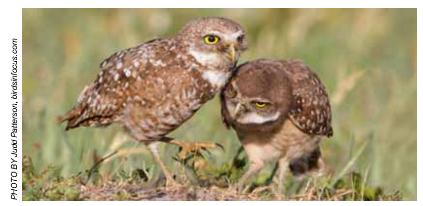
The BURROWING OWL is the only North American raptor to nest in the ground and often occupy burrows or cavities abandoned by other wildlife species. These owls are often easily seen during the day standing or roosting near their burrow. When threatened, chicks of this species emit a noise that sounds like a rattlesnake to deter potential predators. While not on the current list for sensitive species, they are definitely in danger of losing habitat and need your support. Contribute to chickadee checkoff on your Form K-40 to help conserve this and other fascinating Kansas critters.

If you have any questions about use tax or about your responsibilities for reporting and paying this tax as an individual Kansas consumer, please contact our Taxpayer Assistance Center (see page 26).